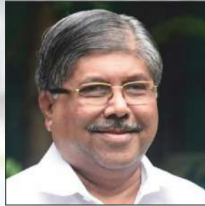
Hon. Shri. Chandrakant Patil Minister, Higher & Technical Education, Government of Maharashtra