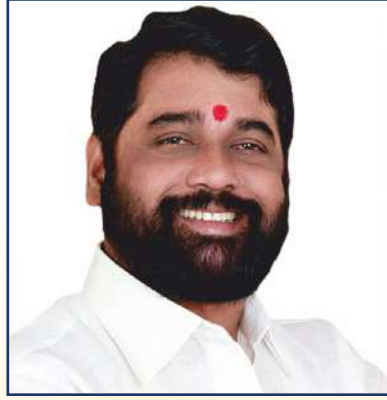
Hon. Shri. Eknath Shinde Chief Minister, Maharashtra State