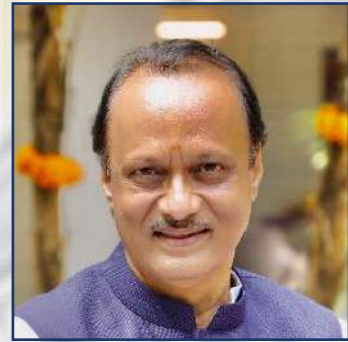
Hon. Shri. Ajit Pawar Dy. Chief Minister, Maharashtra State