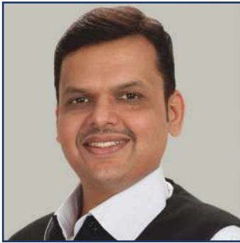
Hon. Shri. Devendra Fadnavis Dy. Chief Minister, Maharashtra State